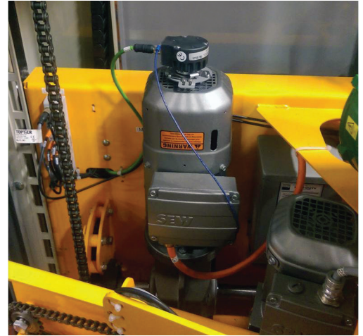
Model 25H encoder mounted on a motor

All cables have small amounts of capacitance between adjacent conductors. This capacitance is a direct function of the cable’s length, and tends to round off the leading edge of the square wave signal, increasing rise times. It can also distort the signal to the extent of causing errors in the system.